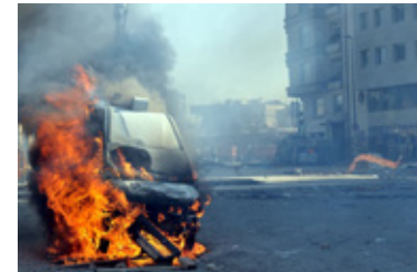
• Political Violence and Terrorism [Inclusive of Looting]