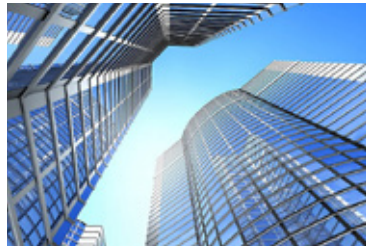
• Property and Engineering