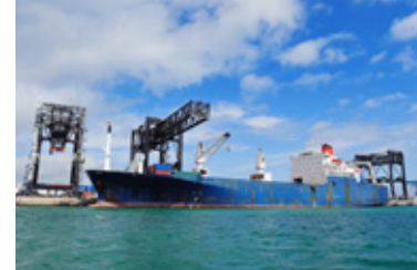
• Marine Cargo, Hull, Cargo & Liabilities