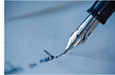
• Bonds and Guarantees