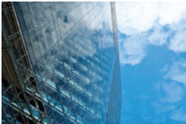
• Miscellaneous Accident